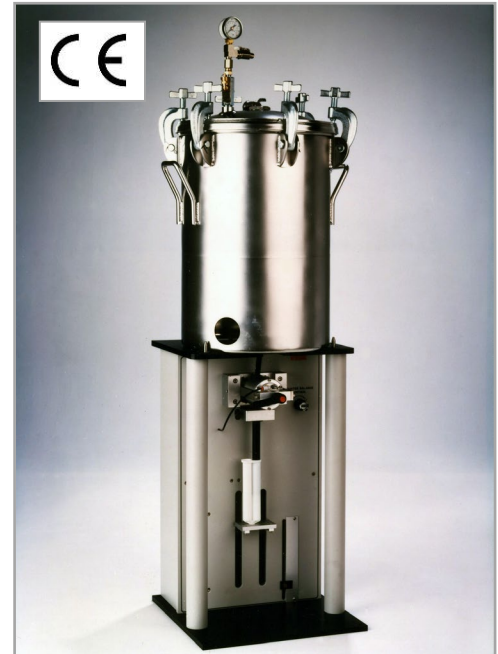
Model 2200 Outfitted with a 10-Gallon Pressure Pot